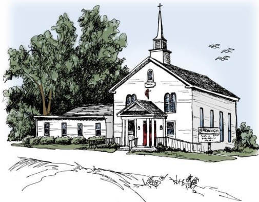
"The church on the curve"