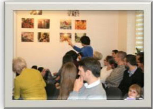
Church Member Explains Stories from "Historia Nadziei"