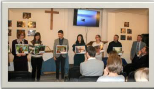
Great Review of "Story of Hope" at the Lublin Baptist Church

Please continue to pray for us as we seek God's direction for the location of our next stage of ministry, beginning this summer, just after we return from our furlough. In our last prayer letter, we mentioned 2 potential locations. However, after a time of prayer, considering our gifts, strengths and abilities, we discovered that neither one of those ministry configurations would have been a good match for us. So, we went back to "square one," searching through each of the 122 existing Baptist Churches and Ministry Points in Poland. To our daily time of prayer and Bible study as a couple, we added a time for ministry discovery. Which ones would our match our criteria for a potential ministry location? Every day we would research and pray for a church. As we did this seemingly long and arduous task, it enabled us to redefine and reset our criteria. We would like to partner with a young Polish pastor, serving solo in a new and under-developed church that demonstrates an energy or desire to grow. By applying these criteria, we were able to narrow down our search to 14 churches. For 14 more days, we researched one of the remaining 14 churches, learning a little about their focus and needs. Through this activity, we have been able to narrow down the list to 2 possible locations. Our next step will be to contact the pastors of these 2 churches and set up visits to the churches in order to further determine the Lord's leading and their willingness for us to come.